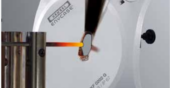
Burning behaviour in glow wire test 960°C High impact withstand IK 09 (10 joule)