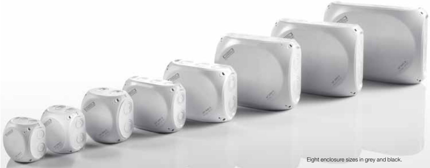
Eight enclosure sizes in grey and black.