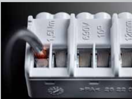
Terminals prevent damage of conductors, also for flexible conductors without ferrule