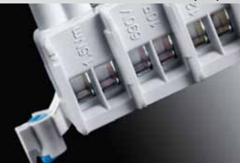
All terminals with 2 clamping units per pole