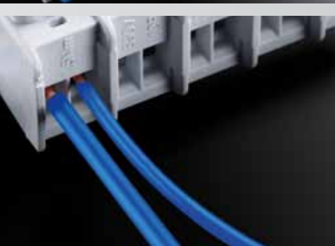
Various conductor cross sections and conductor types