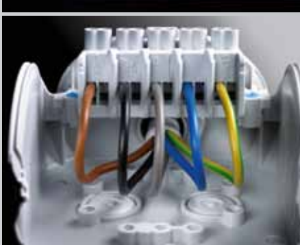
High-position terminals with more space for wiring